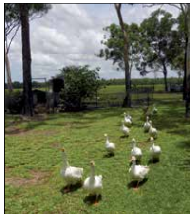
Wallaby Holtze Road, Holtze. LD Map 21-D6. Wallaby Holtze Rd runs off Tulagi Rd behind Finlays Landscaping. Look for signs.

Two separate and distinctly different gardens are part of a large rural family enclave on the outskirts of Darwin. A colourful tropical garden surrounds a low-set home and a private rainforest sets off a classic pre-war Burnett house relocated from Myilly Point. Ducks, geese, chooks, goats and damara sheep all enjoy their rural lifestyle at Wallaby Walkabout, and young visitors will be able to pat and feed the sheep and goats.